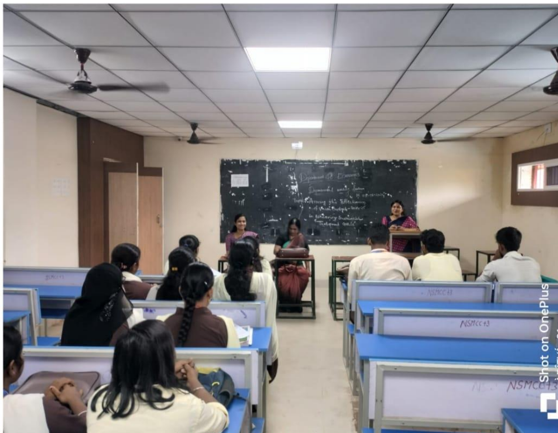
"Assessing the effectiveness of Union Budget 2024 in achieving Sustainable Development Goals" DEPARTMENT OF ECONOMICS