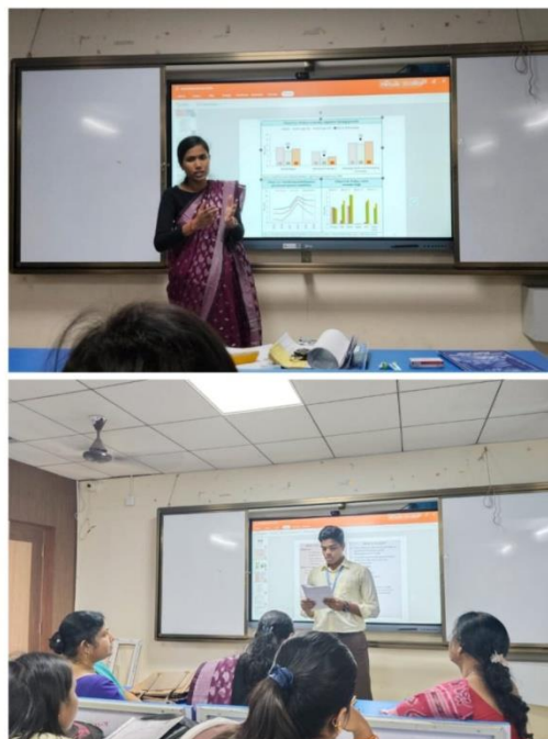
"Economic Survey: A Review of India's Macro-Economic Performance" DEPARTMENT OF ECONOMICS

This seminar provided insights into the Economic Survey 2024. Students discussed key macroeconomic indicators and policy recommendations, enhancing their analytical understanding.